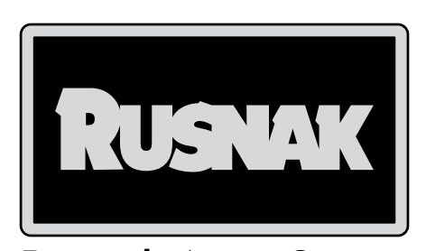
Rusnak Auto Group